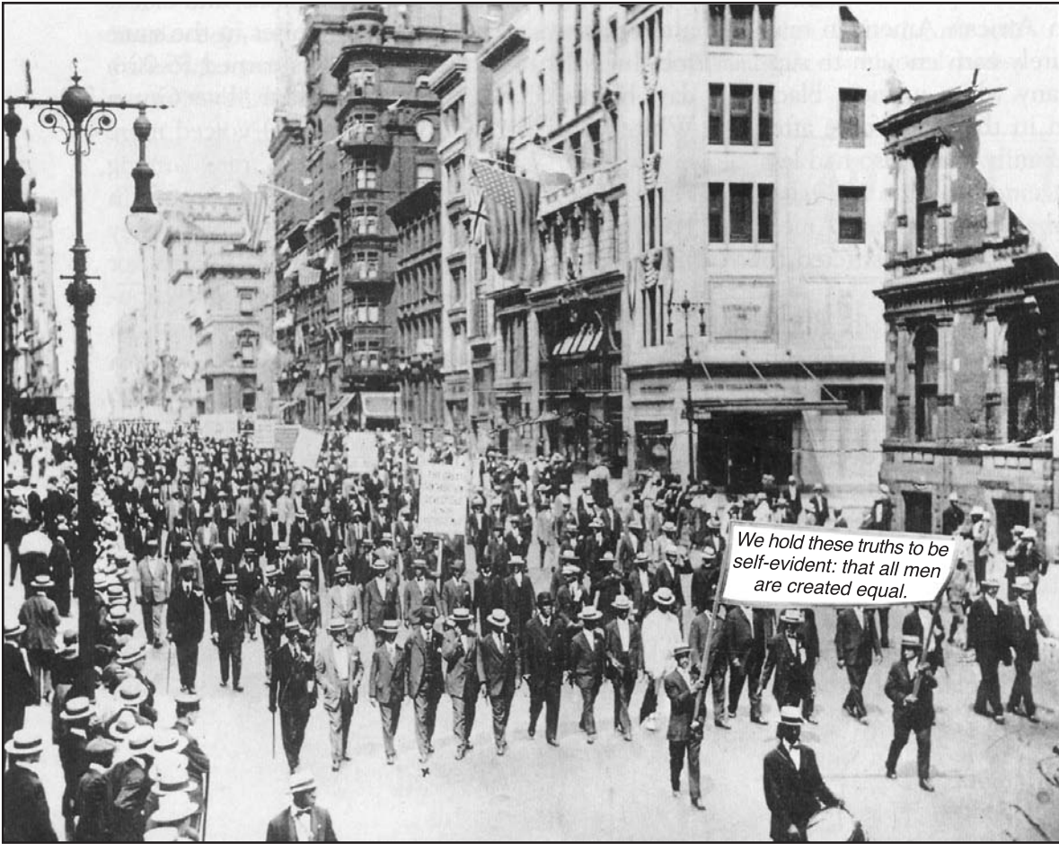
Parade in New York City sponsored by the NAACP in 1917