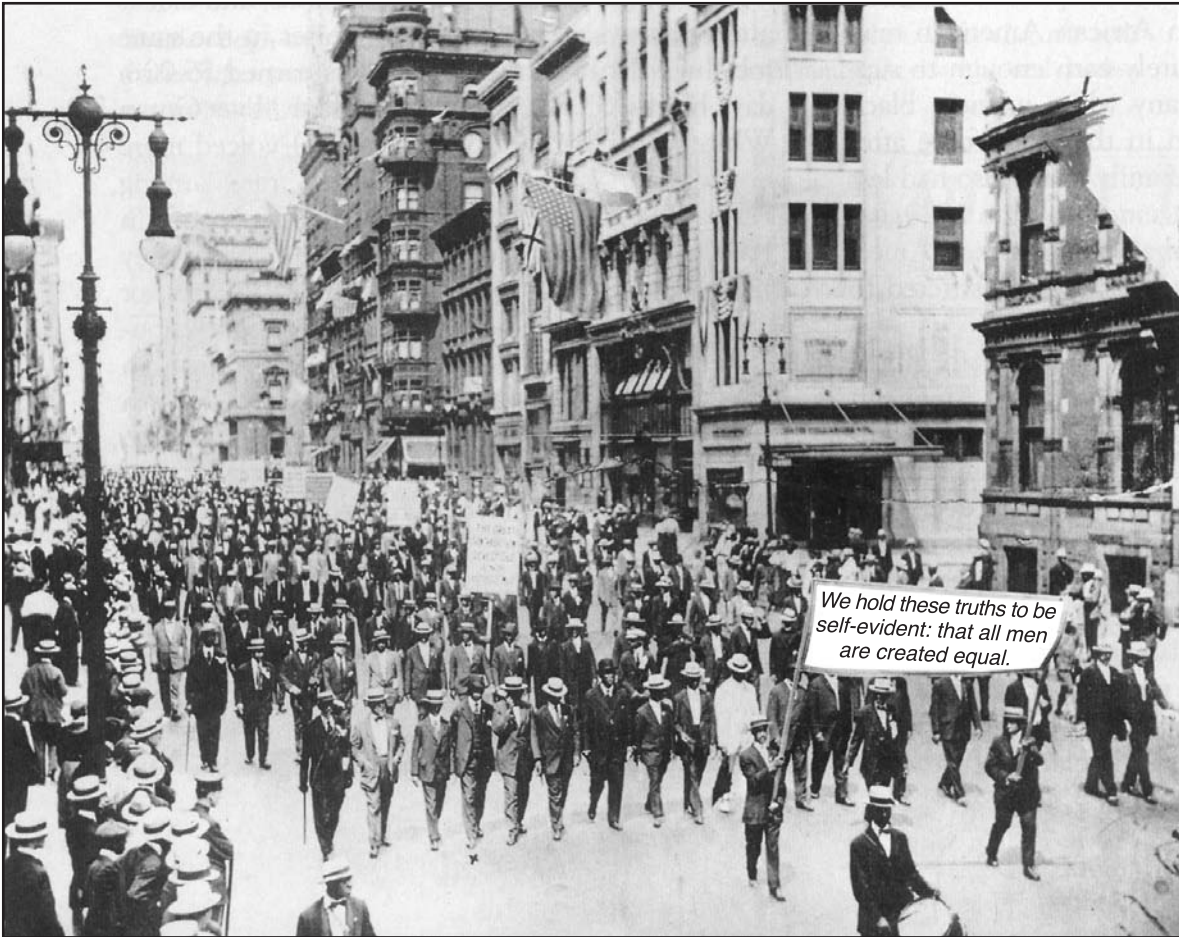
Parade in New York City sponsored by the NAACP in 1917