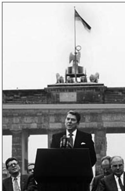
President Ronald Reagan speaks on the West Berlin side of the Brandenburg Gate, June 12, 1987.

Source: President Ronald Reagan, speech at the Brandenburg Gate, June 12, 1987